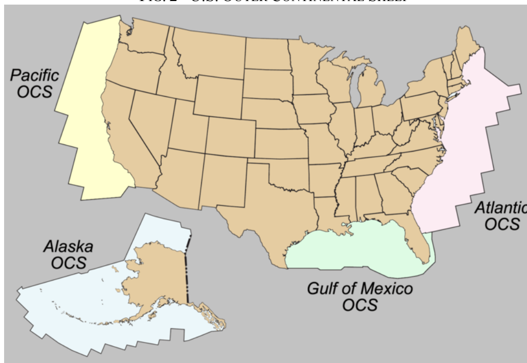
FIG. 2 - U.S. OUTER CONTINENTAL SHELF