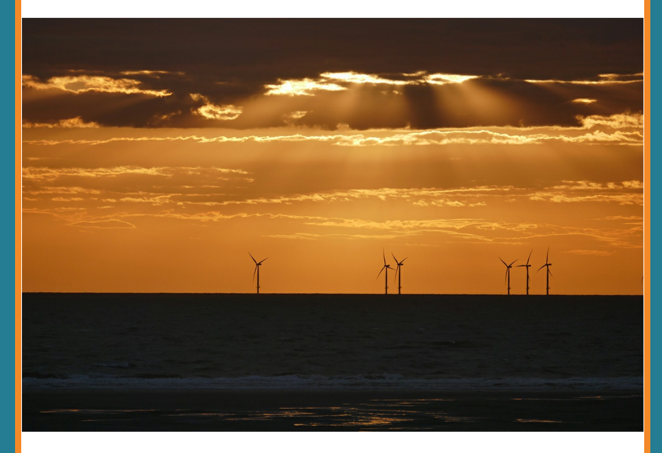
NSGLC's monthly e-newsletter with publication and research highlights, as well as news alerts on other major activities.