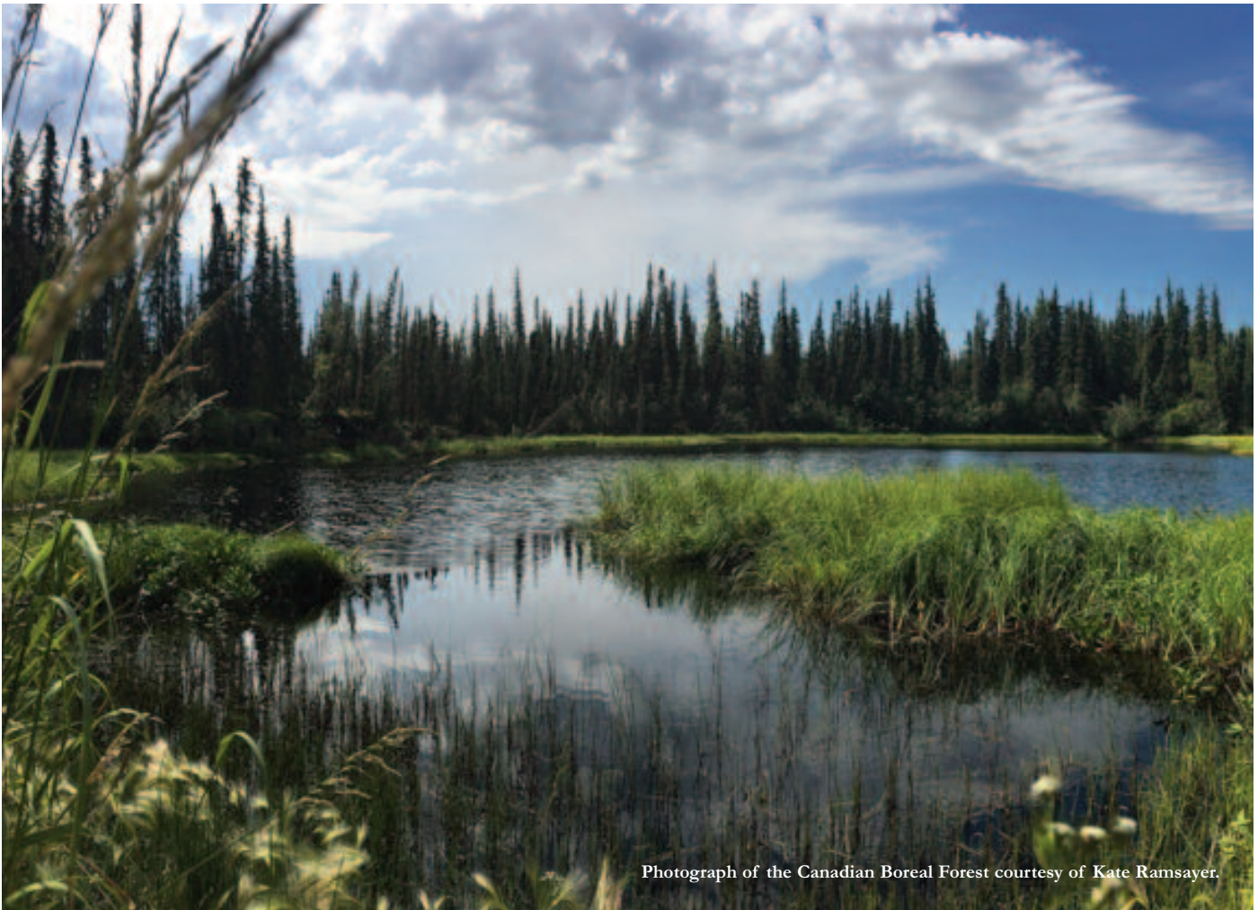
Photograph of the Canadian Boreal Forest courtesy of Kate Ramsayer.

G reenpeace and energy developers are at odds over a recent legal strategy that attempts to penalize environmental groups for their political protests and activism under a federal law aimed at organized crime. Thus far, in the only presently resolved case, the U.S. District Court for the Northern District of California sided with the environmentalists. The court suggested that these suits are not commenced in good faith but, rather, are aimed at silencing free speech and protected protest.