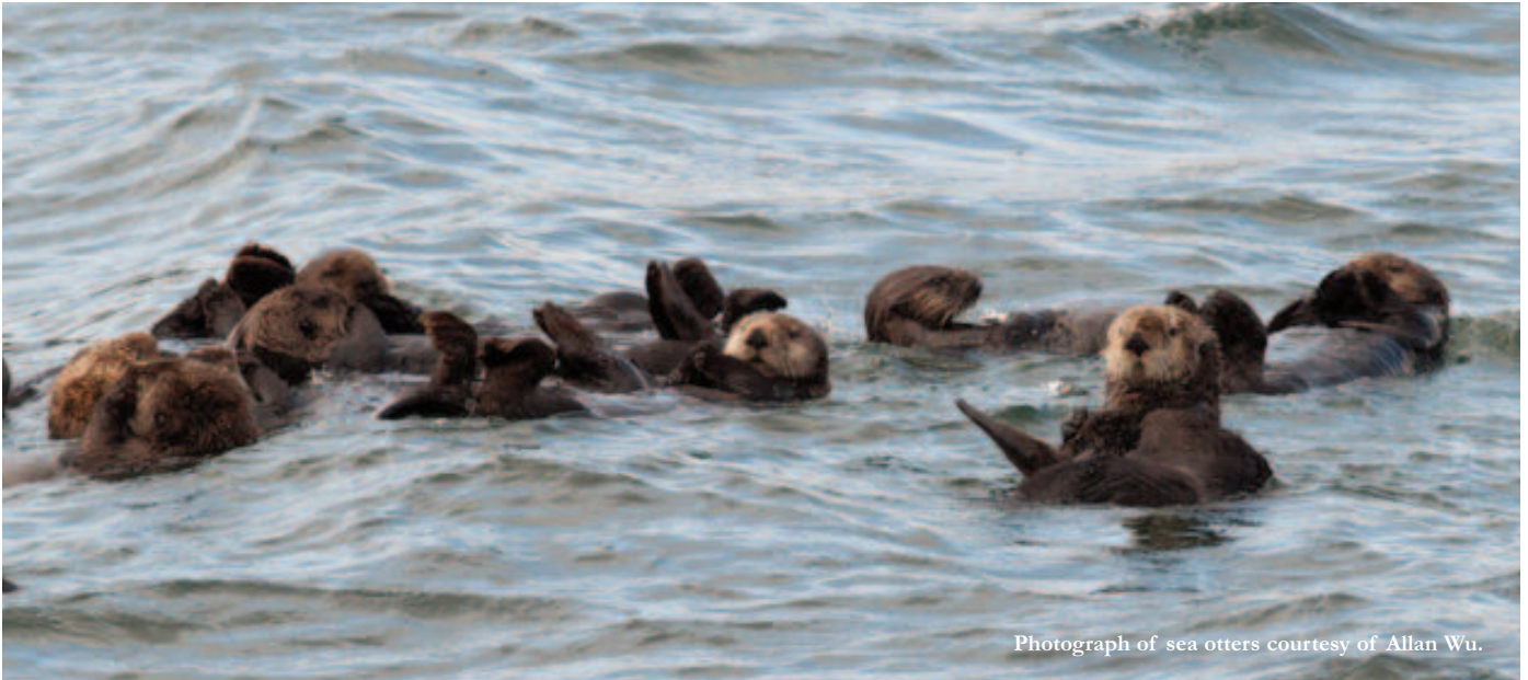
Photograph of sea otters courtesy of Allan Wu.

In 1987, the U.S. Fish and Wildlife Service (FWS) implemented an otter relocation plan intended to stimulate the population of southern sea otters (also known as California sea otters), but the population continued to dwindle. Since its goals never came to fruition, the FWS evaluated and officially terminated its program in 2012. Upset about losing their unique set of benefits from the program, several fishing industry advocates sued the FWS in 2013, claiming the agency did not have the authority to terminate its program without an act of Congress. In March, the U.S. Court of Appeals for the Ninth Circuit ruled in favor of the FWS, holding that the agency has the authority to terminate its failed program, and the sea otters have the autonomy to choose their habitats once again. 2