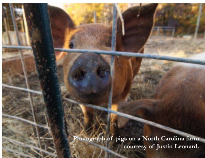
Photograph of pigs on a North Carolina farm courtesy of Justin Leonard.

Legislation may also prove to be a barrier in other states. Just as North Carolina successfully implemented H.B. 467 as well as the legislation capping punitive damages, other states are free to do the same. As more of the North Carolina cases are decided and cases in other states are filed, both environmental advocates and the agriculture industry will begin to see unveiled the true future of nuisance actions filed against industrialized livestock operations. ☘