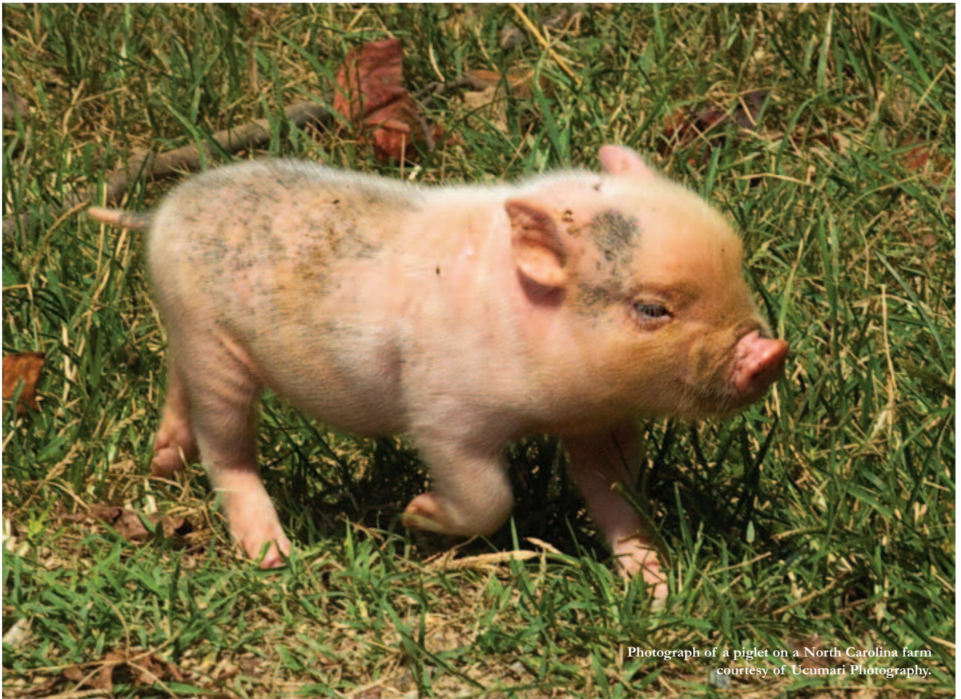
Photograph of a piglet on a North Carolina farm courtesy of Ucumari Photography.

North Carolina is the second highest producer of commercial pork—raising an estimated 7.5 million hogs annually in just five of its eastern counties. 2 All those animals produce an equally astonishing amount of waste—around 15.5 million tons of feces per year, according to the U.S. Government Accountability Office. 3 Methods of managing that waste as well as the close proximity of many concentrated animal feeding operations (CAFOs) to residential areas has yielded a wave of litigation