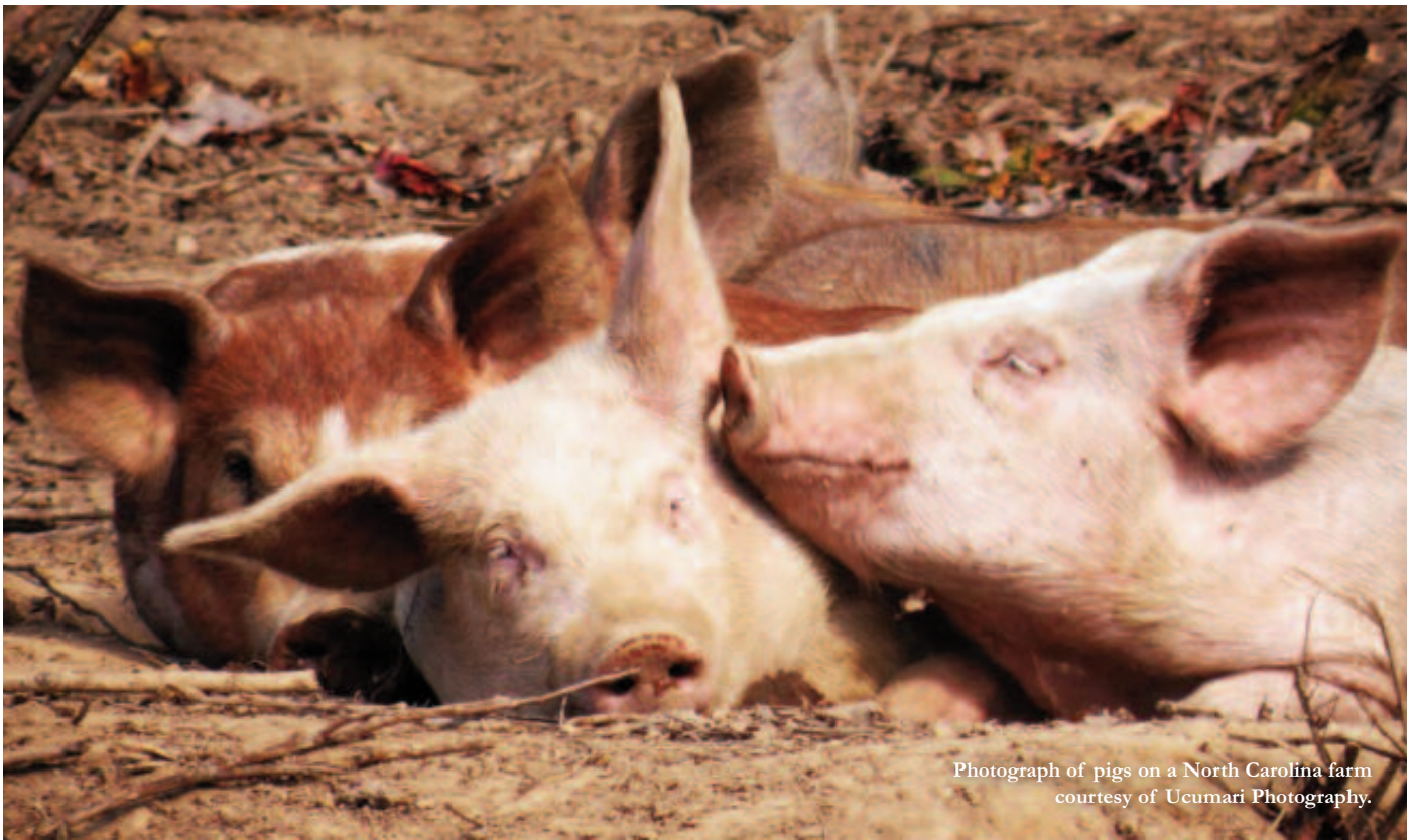
Photograph of pigs on a North Carolina farm courtesy of Ucumari Photography.