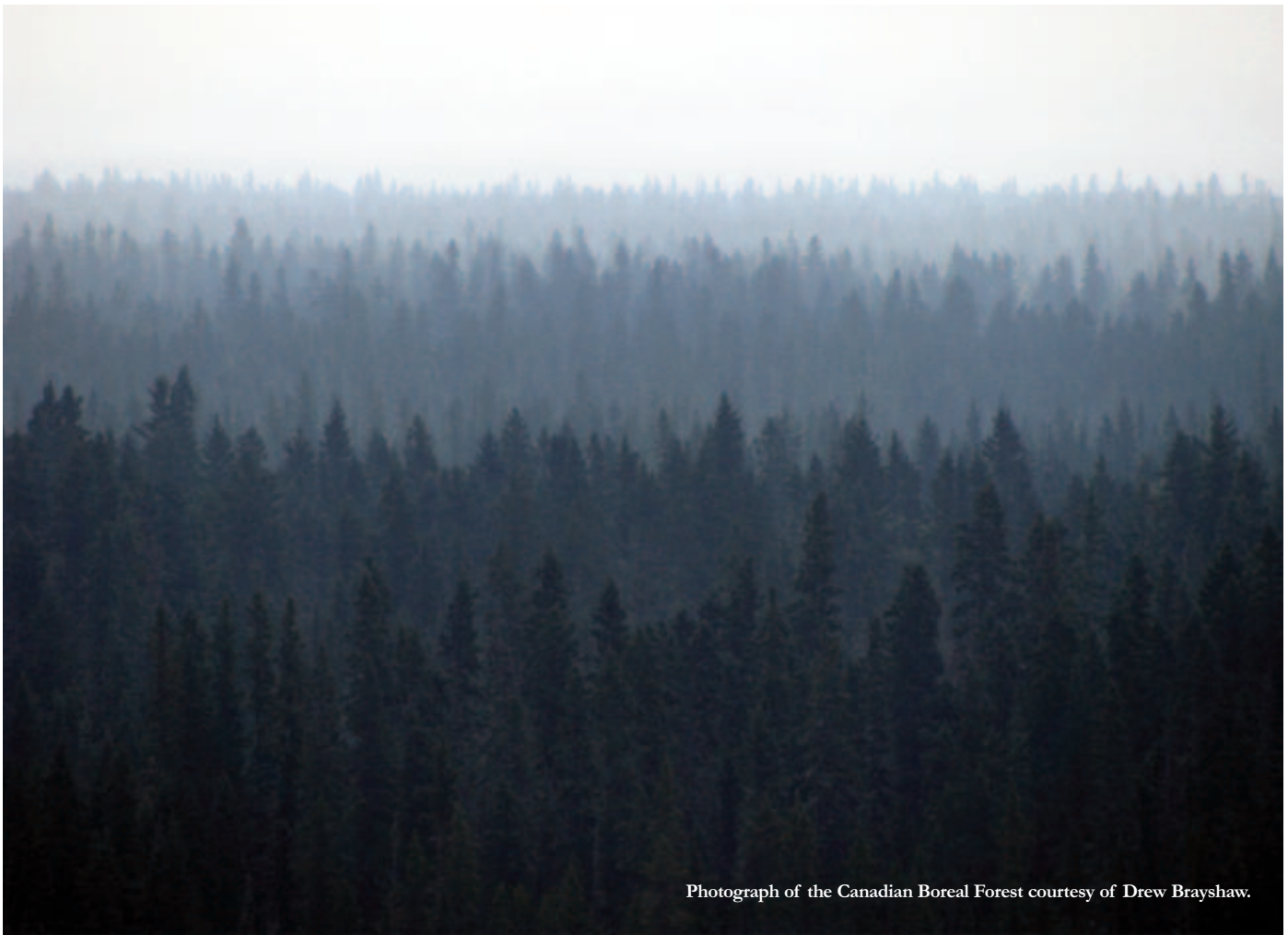
Photograph of the Canadian Boreal Forest courtesy of Drew Brayshaw.

and federal and state tax authorities by Greenpeace claiming to be a tax-free charitable organization, inciting cyber-attacks, intentionally and maliciously interfering with Energy Transfer’s business relationships, and causing threats of violence and the purposeful destruction of private and federal property.