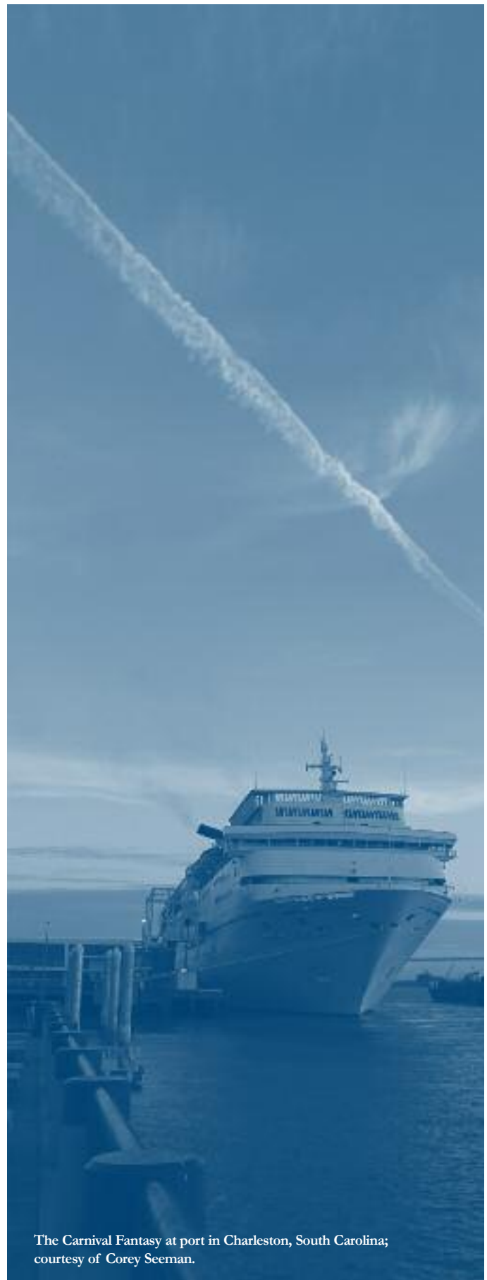
The Carnival Fantasy at port in Charleston, South Carolina; courtesy of Corey Seeman.