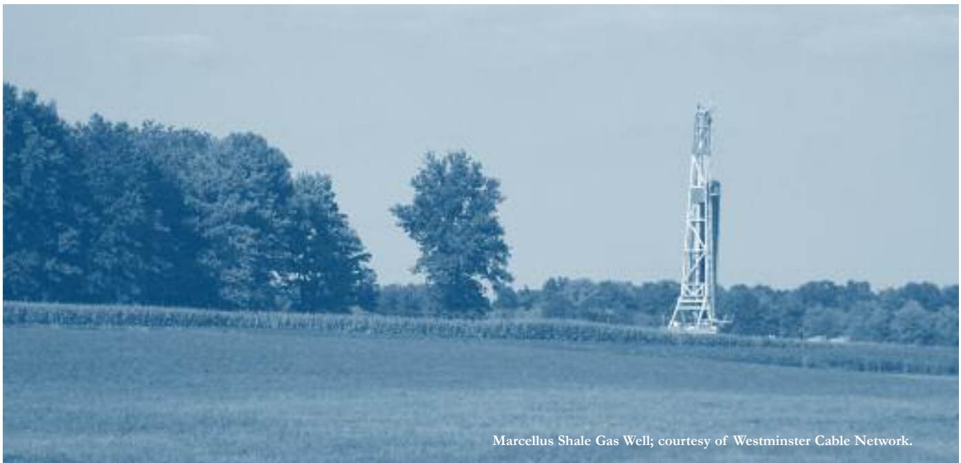
Marcellus Shale Gas Well; courtesy of Westminster Cable Network.

The search for alternative energy sources that will move the United States away from oil dependence continues, which has led to a recent boom in natural gas development. Growth in the industry has been rapid on the East Coast in particular where a large amount of natural gas resides in the Marcellus Shale Formation.