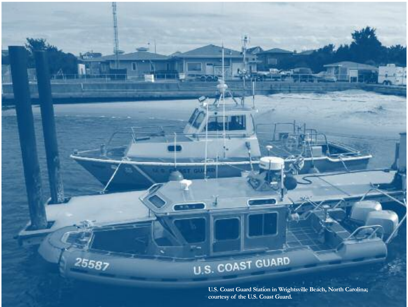
U.S. Coast Guard Station in Wrightsville Beach, North Carolina; courtesy of the U.S. Coast Guard.