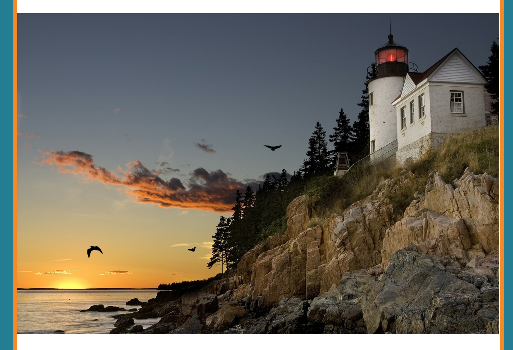
NSGLC's monthly e-newsletter with publication and research highlights, as well as news alerts on other major activities.