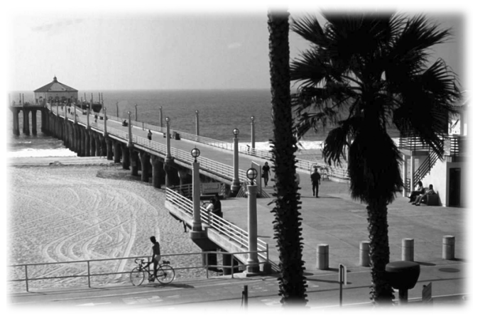
\label{eq:photograph} Photograph \ courtesy \ of \ @Nova \ Development \ Corp.

Unlike the trial court, the Eleventh Circuit determined that the Aruba Grand did have a duty to Lienhart. The court found that Lienhart's injuries resulted from a "risk the Aruba Grand created and failed to warn or guard against."<sup>2</sup> The Aruba Grand controlled the area of the beach where Lienhart was sitting and knew that one of its tenants, Unique Sports, transported equipment in the area. The Aruba Grand was also aware that Unique Sports drove across the public beach without any demarcation of a driving path and without back-up devices on the trucks. The Eleventh Circuit concluded that the Aruba Grand had created a dangerous situation by allowing Unique Sports to