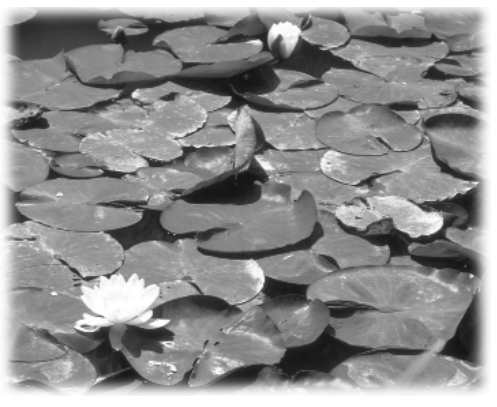
ern and western boundaries

Baccarat argued that all jurisdictional claims by the Corps must be factually based and the Corps cannot assert jurisdiction over all adjacent wetlands because such a broad determination is "arbitrary and capricious" for failure to articulate a rational connection between the facts found and the choice made.<sup>6</sup> The Court disagreed with