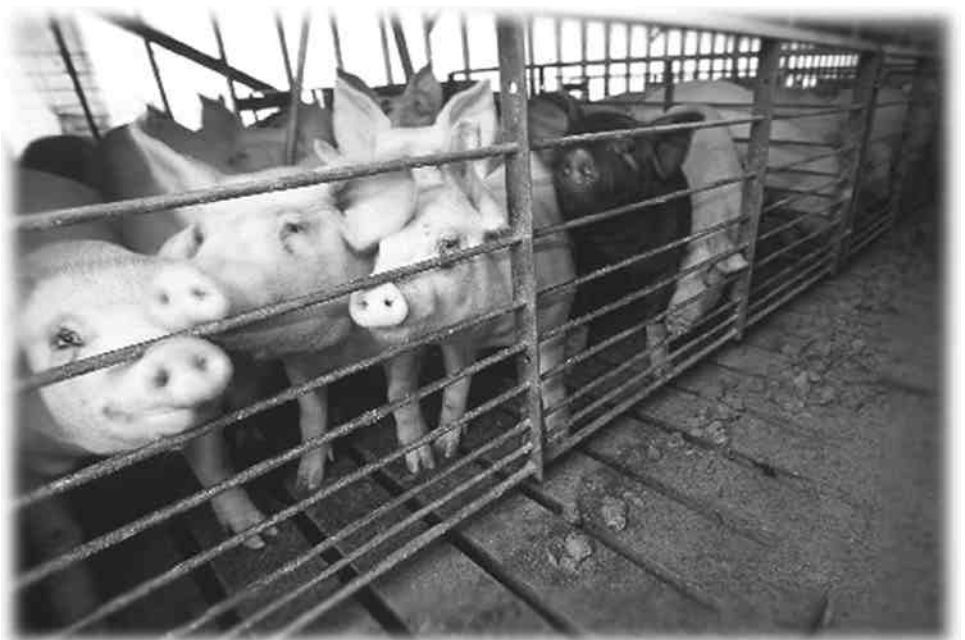
Photograph of hog farm courtesy of Natural Resources Conservation Service.