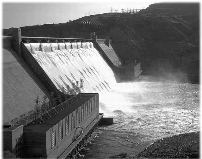
Photograph of dam from ©Nova Development Corp. collection.