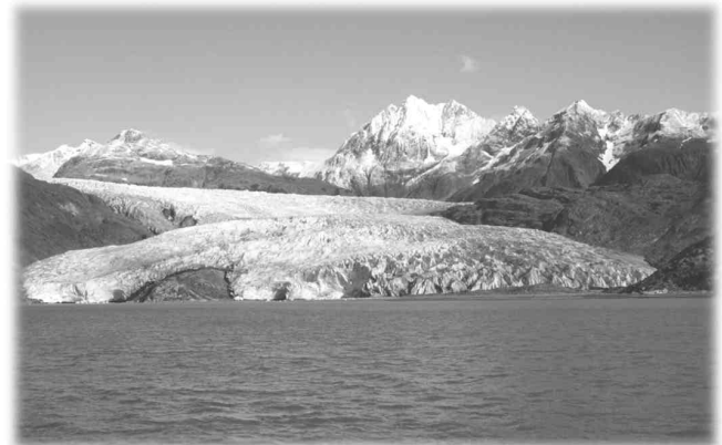
Photograph of Glacier Bay