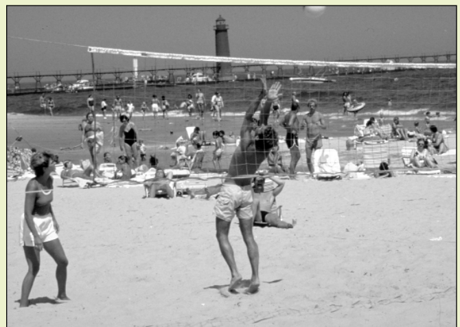
Beach at East Harbor State Park, Port Clinton, Ohio