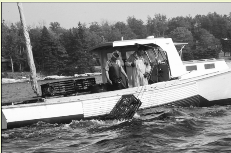
Hauling in lobster trap

In 1999, the NMFS proposed Amendment 3, which would withdraw the existing MSA regulations and adopt new regulations under the authority of the Atlantic Coastal Act. Specifically, not only would the new plan bestow more stringent regulations in both Areas 1 and 3 but would move the thirty mile boundary between the areas an additional twenty miles offshore. The consequences were significant for lobster fishermen, especially those accustomed to