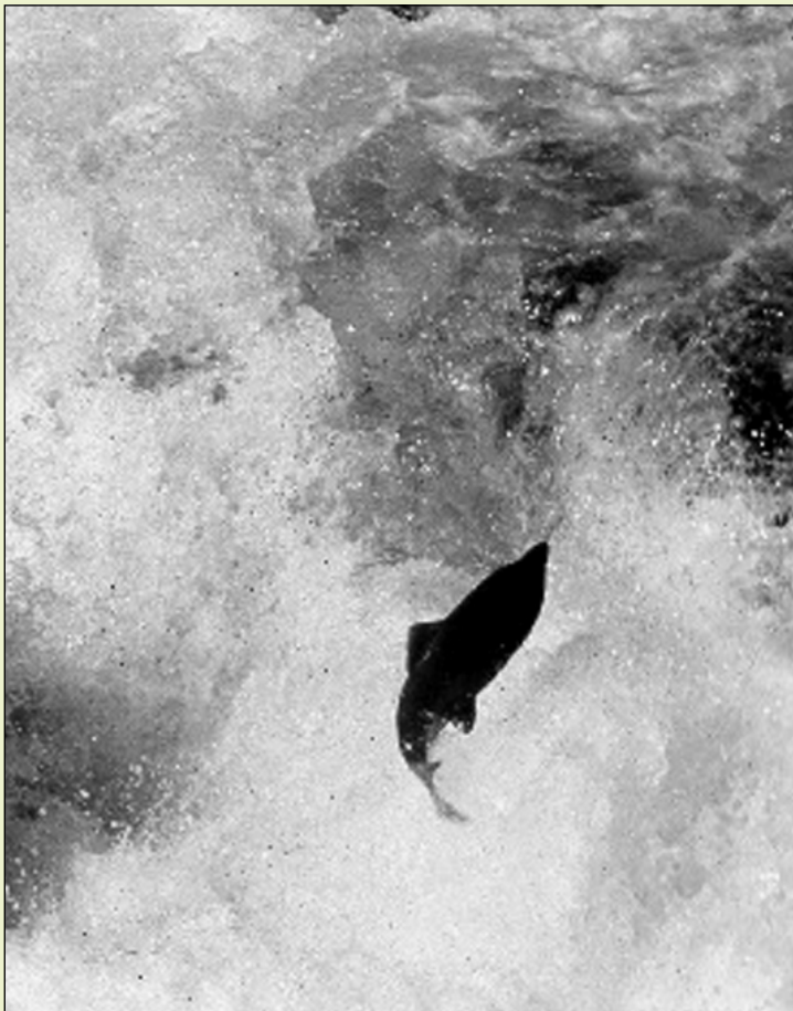
Salmon jumping

Before the court could determine the total amount of water lost, it had to establish when the governmental takings commenced. The plaintiffs argued that the federal government’s liability attached on February 3, 1992, the day the Delta Cross Channel gates were closed. The court disagreed. Prior to the issuance of the first BO on February 14, 1992, the Department’s role was voluntary. While the court recognized that the gates were closed in anticipation of a federal directive, the gate closure on February 3 was not actually compelled by a federal mandate pursuant to the ESA. Therefore, the 23,251 acre-