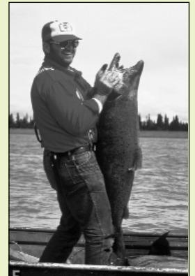
Catching a Chinook Salmon in Alaska

Have you always wanted to fish for salmon in Alaska, but shied away because you were too busy to spend a whole season on a commercial boat? Now may be your chance. A bill has been introduced in Alaska that would allow tourists to purchase a one-day commercial fishing license for $30. This idea, similar to “dude” ranching, would allow commercial fishermen to provide tourists with a hands-on experience. While tourists are currently allowed on commercial boats, they may not participate unless they purchase a crew license costing $60 for residents and $180 for non-residents. The only question remains, if the bill passes, will rugged commercial fishermen actually allow tourists on their boats?