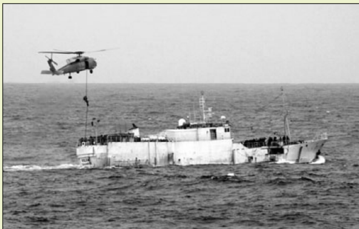
Boarding the Volga

In February, the International Maritime Organization adopted the “International Convention for the Control and Management of Ships’ Ballast Water and Sediments” to address and hopefully prevent the spread of harmful aquatic organisms via ballast water. The Convention requires all ships to prepare and implement a Ballast Water and Sediment Management Plan and carry a Ballast Water Record Book. There are also requirements for research and monitoring and certification and inspection. The mandatory regulations will be phased in over a period of years, starting in 2009. The Conference was attended by representatives from 74 states and the Convention will come into force 12 months after ratification by 30 states representing 35 percent of world merchant shipping tonnage. For more information, visit the IMO’s website at http://www.imo.org .