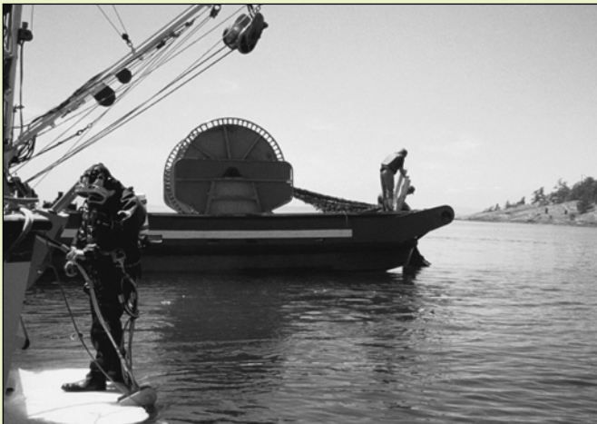
Dive Team recovers a derelict net from Puget Sound

In 2002, the Commission sponsored and shepherded Washington Senate Bill SB6313 through the