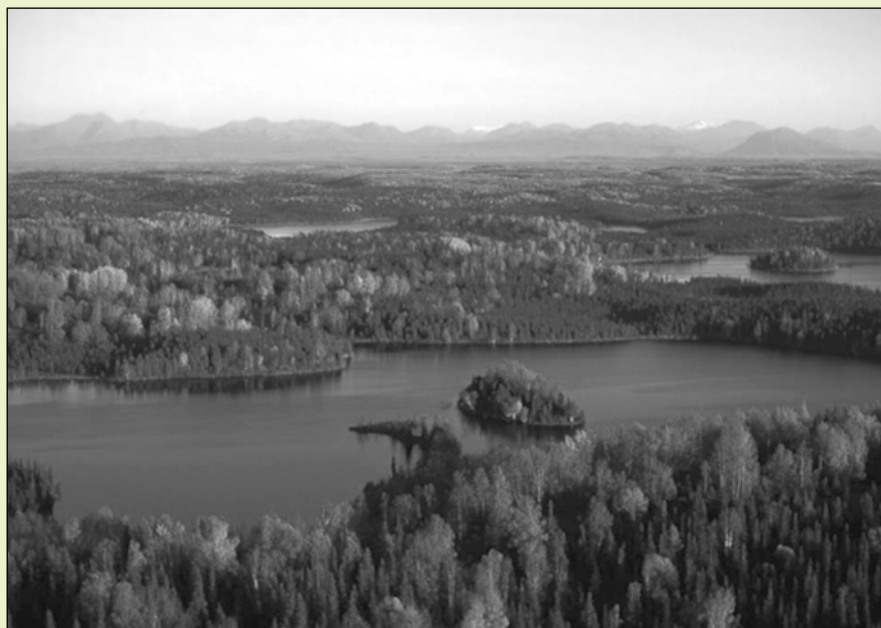
Kenai Refuge Lakes

sections of the Act to determine Congressional intent. Wilderness is partially defined as "an area where the earth and its community of life are untrammeled by man." 24 Also, the Wilderness Act's declaration of policy includes the goal of "protection of these areas" and "preservation of their wilderness character." 25 The Ninth Circuit found this language unambiguous enough to find clear congressional intent to preclude commercial enterprises in designated wilderness areas, regardless of the form of commercial activity. Thus, the FWS's decision regarding the enhancement project was not entitled to deference as it failed to give effect to the plain meaning of the statute.