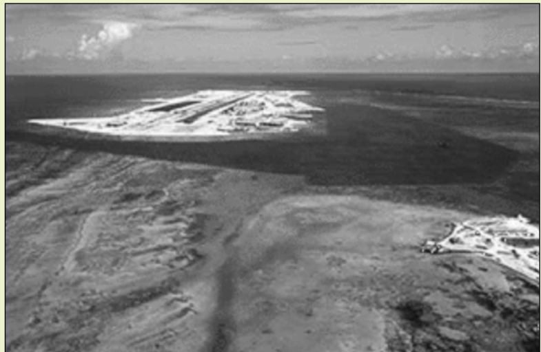
Aerial view of Johnston Atoll

Burum’s account differed in that he claimed Ilaszczat sustained his injury when he charged at Burum immediately after the demonstration,