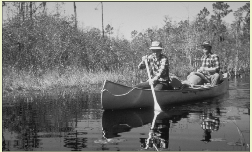
Canoeing in Georgia

The second option, changing Georgia's definition of navigable rivers to be more inclusive, is also a viable alternative. The statutory definition could be amended to include streams capable of being used for canoeing. Another possibility is adoption of the federal standard of navigability, as set forth in United States v. Harrell , 926 F.2d 1036, 1039 (11th Cir. 1991), which depends on whether a river is used, or susceptible of being used, in its ordinary condition to transport commerce. Under this definition, the ability to commercially float logs is evidence of navi-