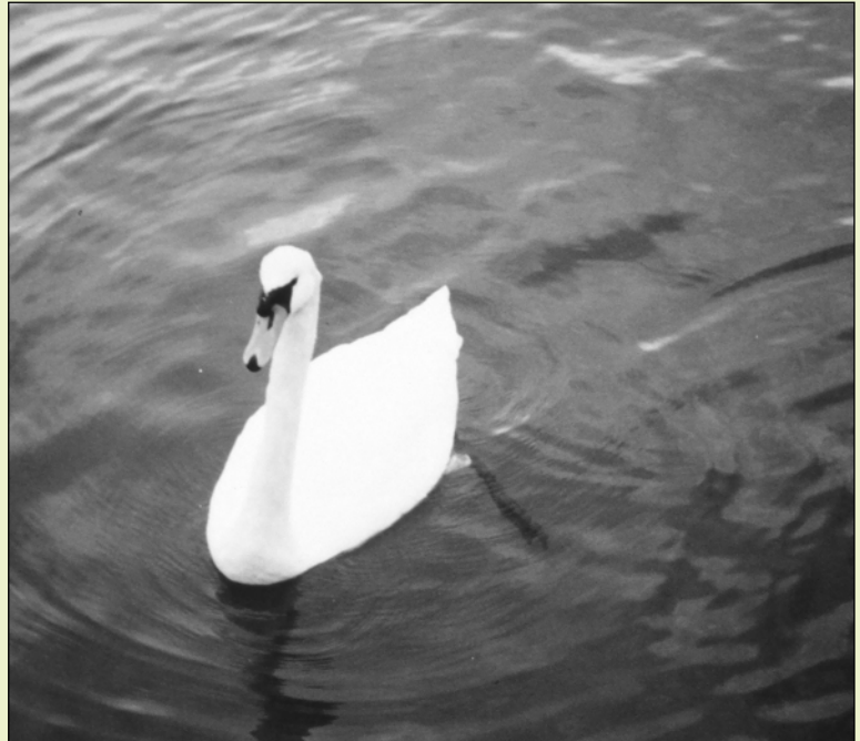
Mute Swan

The court held that although MDNR specified which public lands would be rendered “swan free” as well as provided a generalized description of the types of areas where “removal” activities would take place, MDNR failed to specify the localized and specific types of damage mute swans cause in those areas, nor did MDNR indicate the