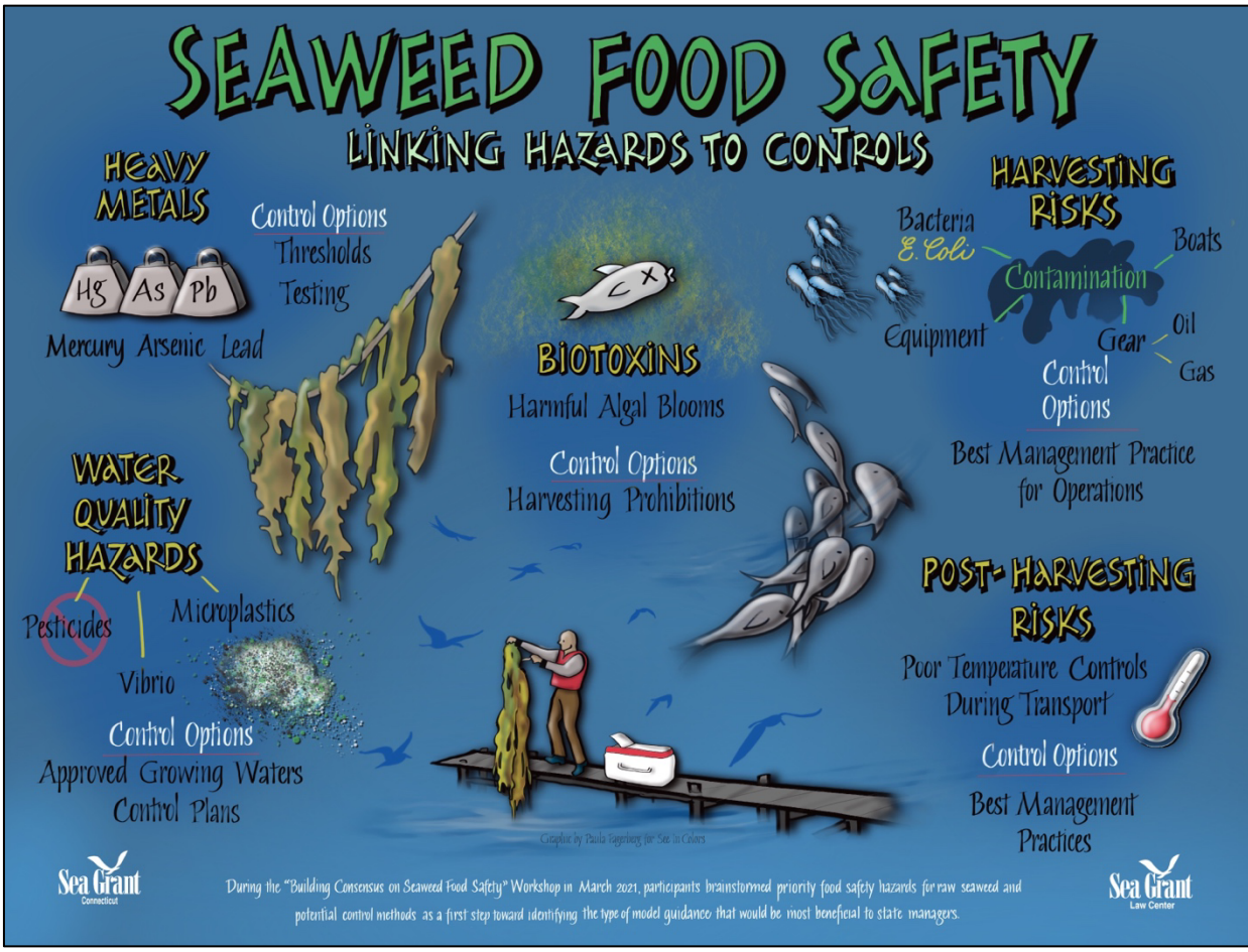
Figure 1 . Artistic interpretation of the high-level takeaways of the workshop brainstorming session on linking seaweed food safety hazards to possible control options.

In 2022, the NSGLC will work to translate the workshop participants' preferred policy approaches into a model law, regulation, or guidance document for use by state managers in developing their seaweed aquaculture regulatory programs. With the assistance of a multidisciplinary Advisory Committee, which will include workshop participants, the NSGLC will identify the appropriate regulatory focus for the model document, identify key provisions that should be included, and draft the guidance document. A draft of the model document will be circulated for peer review and comment to workshop participants and appropriate committees of the Association of Food and Drug Officials (AFDO). The final document will be made available electronically on the project webpage and distributed via email, social media, and partner websites.